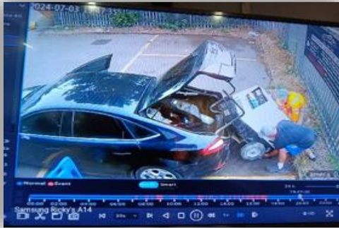
Grays AFA 04.07.2024 (Rail)