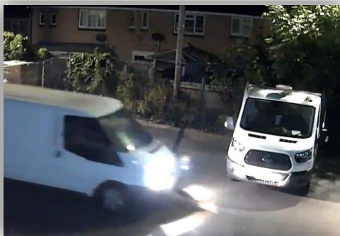
Godstone – Theft of a tipper