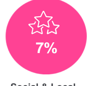
Social & Local Economic Value